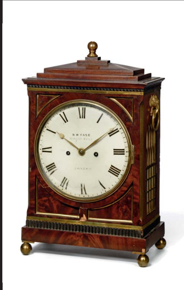
Lot 61 A GEORGE III BRASS-MOUNTED MAHOGANY STRIKING TABLE CLOCK B.W. FAZE, LONDON, CIRCA 1820 18 in. (46 cm.) high £1,200 – 1,800

FIND OUT MORE AT christies.com BY SEARCHING SALE # 5925