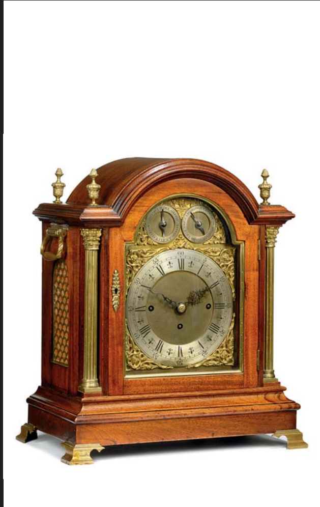
Lot 186 A VICTORIAN BRASS-MOUNTED MAHOGANY QUARTER STRIKING TABLE CLOCK LATE 19TH CENTURY 18¼ in. (86 cm.) high £1,200 – 1,800

FIND OUT MORE AT christies.com BY SEARCHING SALE # 5925