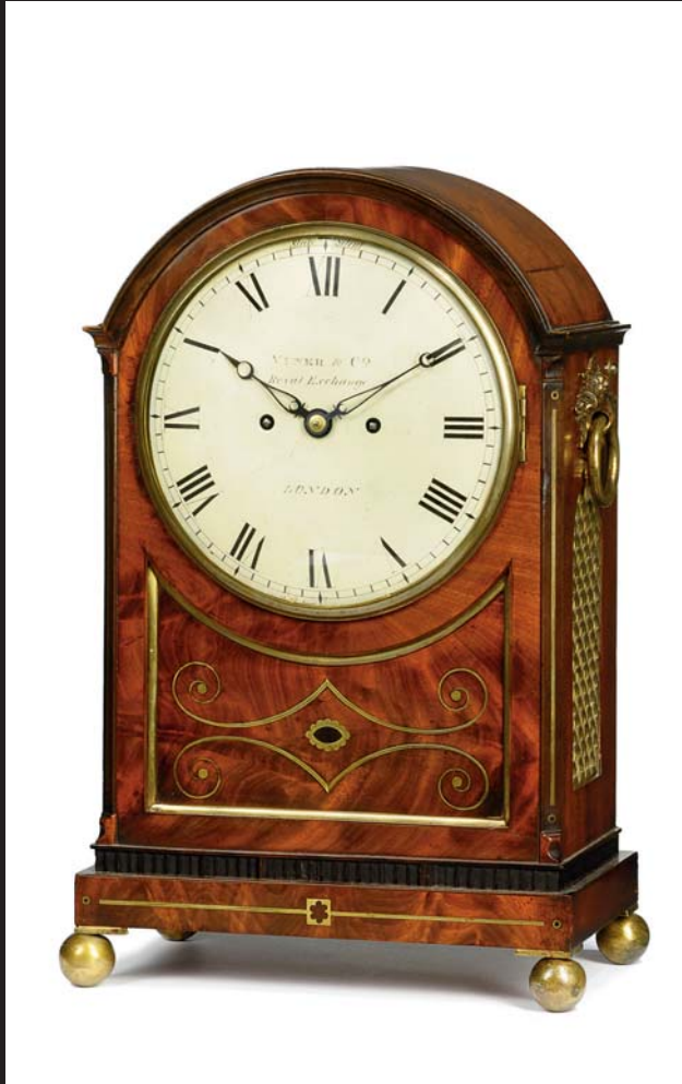
Lot 118 AN EARLY VICTORIAN BRASS-MOUNTED MAHOGANY STRIKING EIGHT DAY TABLE CLOCK VINER AND CO., ROYAL EXCHANGE, LONDON. CIRCA 1840 18 in. (46 cm.) high £1,500 – 2,000