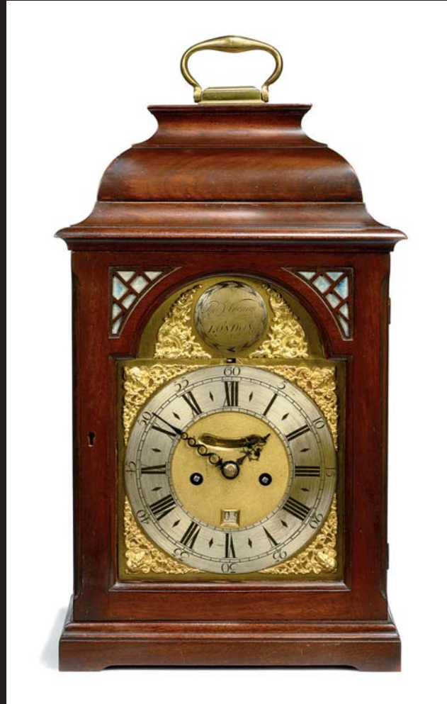
Lot 20 A GEORGE II EBONISED EIGHT DAY TIMEPIECE TABLE CLOCK WITH PULL QUARTER REPEAT DAVID HUBERT, LONDON, CIRCA 1740 17½ in. (44.5 cm.) high £2,000 – 3,000