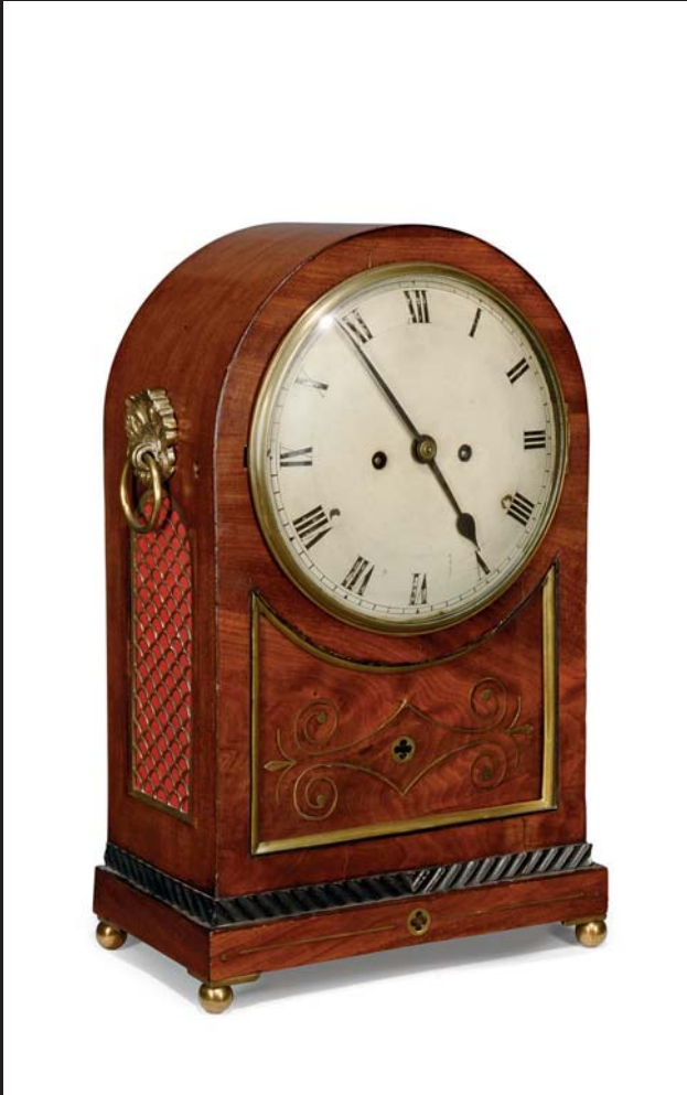
Lot 735 A GEORGE III MAHOGANY STRIKING EIGHT DAY TABLE CLOCK FIRST QUARTER 19TH CENTURY 17½ in. (44 cm.) high £1,200 – 1,800