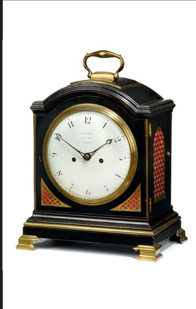
Lot 31 A GEORGE III EBONISED STRIKING EIGHT DAY TABLE CLOCK GRAVELL AND TOLKIEN, LONDON, NO. 3649, EARLY 19TH CENTURY 17 in. (43 cm.) high, handle down £1,200 – 1,800