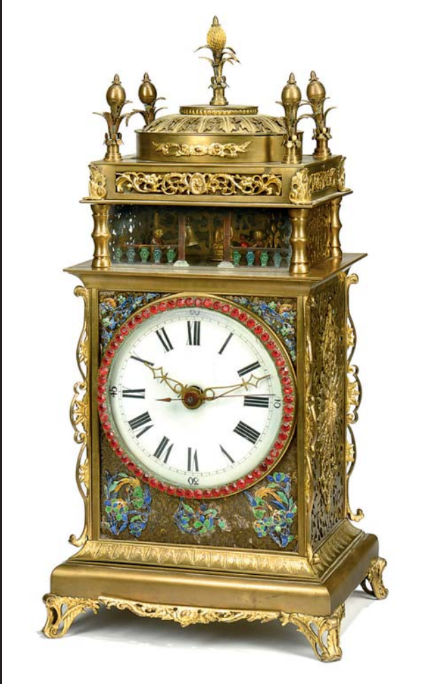
Lot 309 A CHINESE GILT-METAL QUARTER STRIKING TABLE CLOCK WITH LATER AUTOMATON FIRST QUARTER 19TH CENTURY AND LATER 17½ in. (44.5 cm.) high £3,000 – 4,000