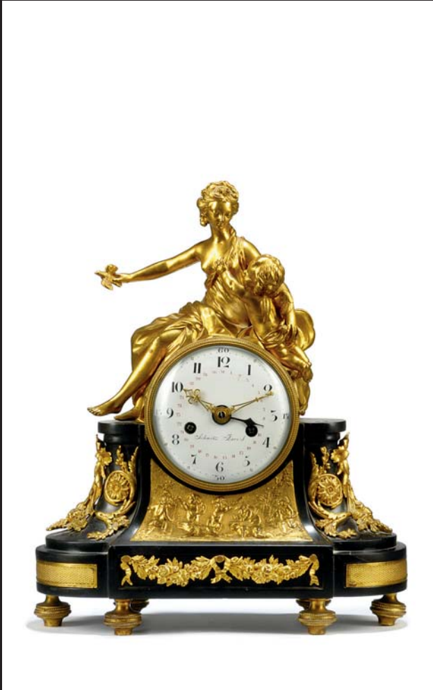
Lot 353 A LOUIS XVI ORMOLU-MOUNTED BLACK MARBLE STRIKING MANTEL CLOCK SCHMIT, PARIS. LAST QUARTER 18TH CENTURY 14¼ in. (37.5 cm.) high £2,000 – 3,000