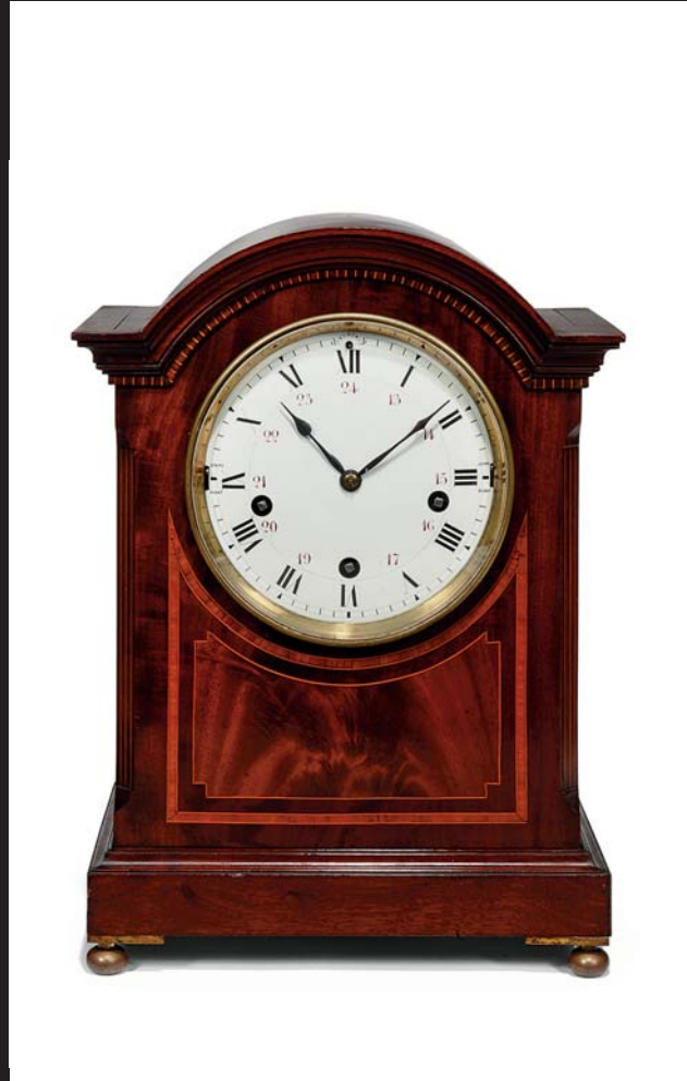
Lot 300 A VICTORIAN MAHOGANY QUARTER STRIKING MANTEL CLOCK MAPLE & CO., LONDON LATE 19th CENTURY 15½ in. (39 cm.) high £600 – 900