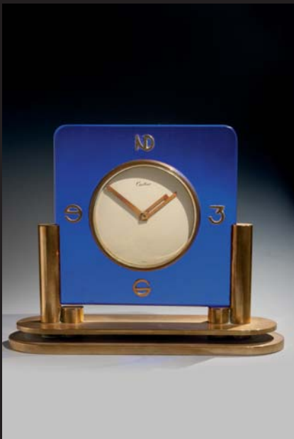
Lot 922 A DESK CLOCK, BY CARTIER 15 x 18 cm. (6 x 7 in.) €1,500-2,500 US$2,100-3,300 GBP £1,400-2,200