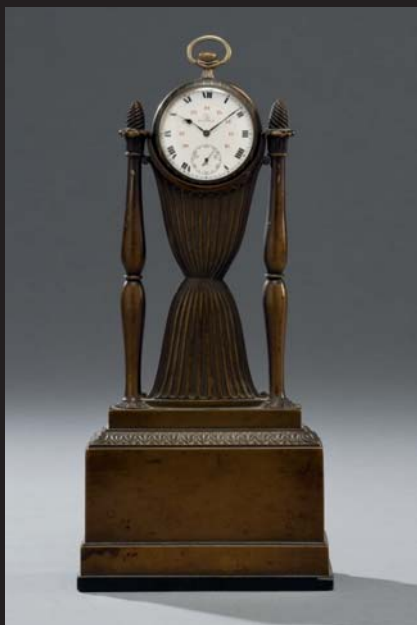
Lot 617 AN ORMOLU MANTEL CLOCK CIRCA 1840 Height: 66 cm. (26 in.), Length: 39 cm. (15 in.) €4,000-6,000 US$5,400-8,000 GBP £3,600-5,300