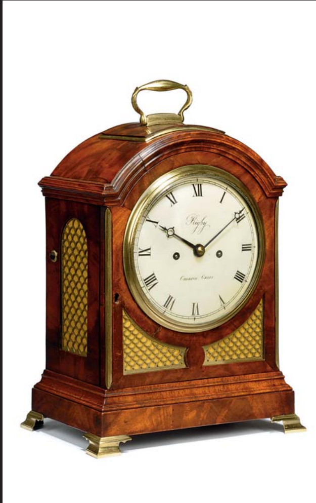
Lot 116 A BRASS-BOUND MAHOGANY STRIKING EIGHT DAY TABLE CLOCK JAMES RIGBY, LONDON. CIRCA 1800 15 in. (38 cm.) high, handle down £3,000 – 5,000