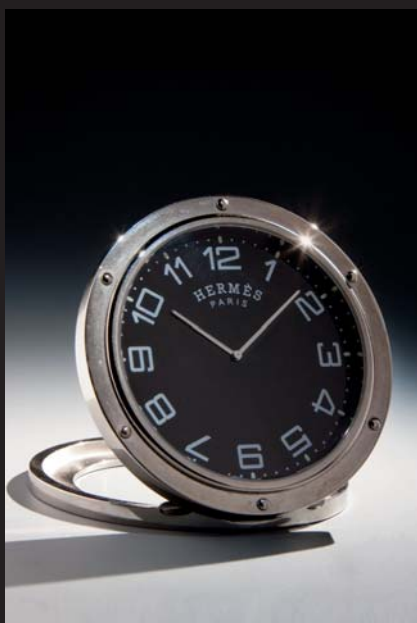
Lot 936 A "CLIPPER" DESK CLOCK, BY HERMÈS Diameter: 7.5 cm. (3 in.) €600-800 US$810-1,100 GBP £540-710