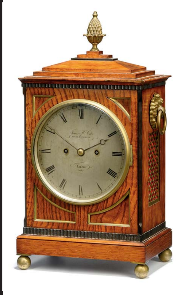
Lot 117 AN EARLY VICTORIAN BRASS BOUND OAK STRIKING TABLE CLOCK JAMES MCCABE, ROYAL EXCHANGE, LONDON, NO. 2087. CIRCA 1840 18¾ in. (47.5 cm.) high £1,200 – 1,800

FIND OUT MORE AT christies.com BY SEARCHING SALE # 5925