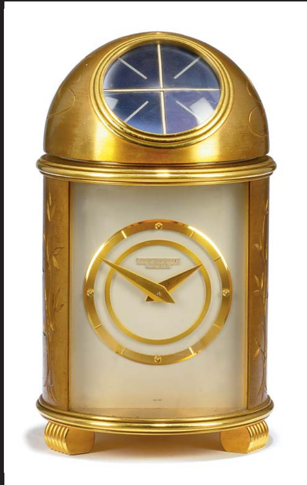
Lot 424 AN ENGRAVED GILT-BRASS SOLAR TABLE CLOCK PATEK PHILIPPE, GENEVA, MOVEMENT NO. 873098, CASE NO. 687.

THIRD QUARTER 20TH CENTURY 8½ in. (22.5 cm.) high £4,000 – 6,000