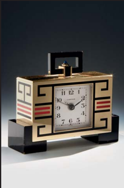
Lot 924 AN ALARM DESK CLOCK, BY CARTIER 9 x 10 cm. (3 x 4 in.) €1,000-1,500 US$1,400-2,000 GBP £900-1,300